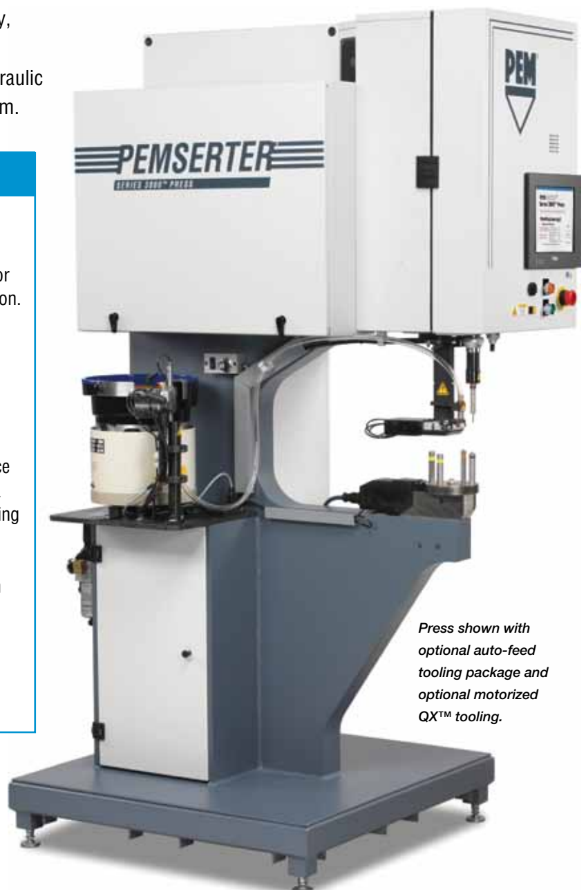
Press shown with optional auto-feed tooling package and optional motorized QX ™ tooling.